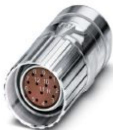
Cable connector, CA, straight, shielded: yes, Screw locking, M23, No. of pos.: 17, type of contact: Socket, Crimp connection, cable diameter range: 3 mm ... 14.5 mm

Please be informed that the data shown in this PDF Document is generated from our Online Catalog. Please find the complete data in the user's documentation. Our General Terms of Use for Downloads are valid ( http://phoenixcontact.com/download )