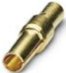
Crimp contact, turned, Single contact, contact diameter: 1 mm, crimp range: 0.08 mm 2 ... 0.22 mm 2