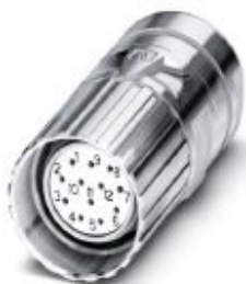
Cable connector, CA, straight, shielded: yes, Screw locking, M23, No. of pos.: 17, type of contact: Socket, Crimp connection, cable diameter range: 10 mm ... 14.5 mm

Please be informed that the data shown in this PDF Document is generated from our Online Catalog. Please find the complete data in the user's documentation. Our General Terms of Use for Downloads are valid ( http://phoenixcontact.com/download )