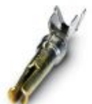
Crimp contact, rolled, Single contact, contact diameter: 1 mm, crimp range: 0.22 mm 2 ... 0.56 mm 2