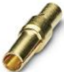
Crimp contact, turned, Single contact, contact diameter: 1 mm, crimp range: 0.14 mm 2 ... 0.56 mm 2