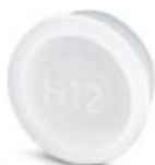
Plastic protection cap for connectors with M23 external thread