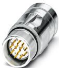
Coupling connector, CA, straight, shielded: yes, for standard and SPEEDCON interlock, M23, No. of pos.: 16, type of contact: Pin, Crimp connection, cable diameter range: 6 mm ... 10 mm

Please be informed that the data shown in this PDF Document is generated from our Online Catalog. Please find the complete data in the user's documentation. Our General Terms of Use for Downloads are valid ( http://phoenixcontact.com/download )