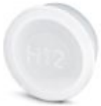
Plastic protection cap for connectors with M23 external thread

Plastic anti-static dust protection cap - RC-Z2469 - 1611797