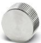
Metal protection cap for signal connectors with M23 external thread

Metal protective cap - RC-Z2104 - 1604260