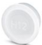
Plastic protection cap for connectors with M23 external thread