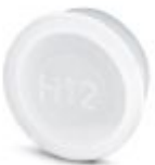
Plastic protection cap for connectors with M23 external thread

Plastic anti-static dust protection cap - RC-Z2469 - 1611797