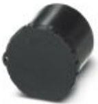
Plastic protection cap, with eye, IP40 for connectors with M23 external thread, RF, SF series