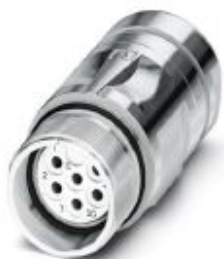
Coupling connector, CA, straight, shielded: yes, for standard and SPEEDCON interlock, M23, No. of pos.: 8+1, type of contact: Socket, Solder connection, cable diameter range: 4 mm ... 6 mm

Please be informed that the data shown in this PDF Document is generated from our Online Catalog. Please find the complete data in the user's documentation. Our General Terms of Use for Downloads are valid ( http://phoenixcontact.com/download )