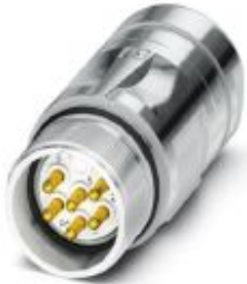
Coupling connector, CA, straight, shielded: yes, for standard and SPEEDCON interlock, M23, No. of pos.: 7, type of contact: Pin, Crimp connection, cable diameter range: 4 mm ... 6 mm

Please be informed that the data shown in this PDF Document is generated from our Online Catalog. Please find the complete data in the user's documentation. Our General Terms of Use for Downloads are valid ( http://phoenixcontact.com/download )