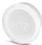
Plastic protection cap for connectors with M23 external thread

Plastic anti-static dust protection cap - RC-Z2469 - 1611797