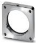
Square mounting flange, Axial seal, 4xM3, flange dimensions: 35 mm x 35 mm

Square mounting flange - RF-Z0003 - 1607905