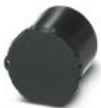
Plastic protection cap, with eye, IP40 for connectors with M23 external thread, RF, SF series