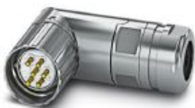
The figure shows the 6-pos. product version

Cable connector, CA, angled, shielded: yes, Screw locking, M23, No. of pos.: 7, type of contact: Pin, Solder connection, cable diameter range: 6 mm ... 10 mm