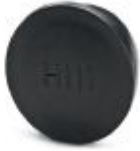
Plastic protection cap, antistatic, for connectors with M23 knurled nut

Plastic anti-static dust protection cap - RC-Z2468 - 1611796