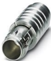
Unlocking tool for contact carriers for snapping in the M23 signal device connectors

Please be informed that the data shown in this PDF Document is generated from our Online Catalog. Please find the complete data in the user's documentation. Our General Terms of Use for Downloads are valid ( http://phoenixcontact.com/download )