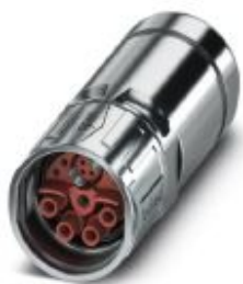
Cable connector, SH, straight long, shielded: yes, SPEEDCON locking, M23, No. of pos.: 4+4+4+PE / 3+N +PE, type of contact: Socket, Crimp connection, cable diameter range: 9 mm ... 12 mm

Please be informed that the data shown in this PDF Document is generated from our Online Catalog. Please find the complete data in the user's documentation. Our General Terms of Use for Downloads are valid ( http://phoenixcontact.com/download )