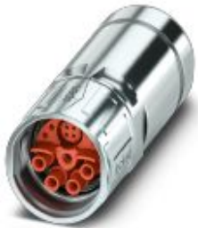
Cable connector, SH, straight long, shielded: yes, SPEEDCON locking, M23, No. of pos.: 8+4+PE, type of contact: Socket, Crimp connection, cable diameter range: 9 mm ... 12 mm

Please be informed that the data shown in this PDF Document is generated from our Online Catalog. Please find the complete data in the user's documentation. Our General Terms of Use for Downloads are valid ( http://phoenixcontact.com/download )