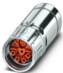
Cable connector, SH, straight long, shielded: yes, SPEEDCON locking, M23, No. of pos.: 8+4+PE, type of contact: Socket, Crimp connection, cable diameter range: 12 mm ... 15 mm

Please be informed that the data shown in this PDF Document is generated from our Online Catalog. Please find the complete data in the user's documentation. Our General Terms of Use for Downloads are valid ( http://phoenixcontact.com/download )