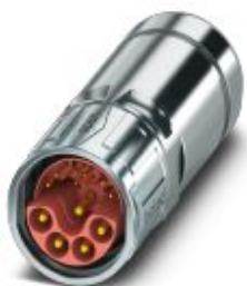
Cable connector, SH, straight long, shielded: yes, SPEEDCON locking, M23, No. of pos.: 8+4+PE, type of contact: Pin, Crimp connection, cable diameter range: 9 mm ... 12 mm

Please be informed that the data shown in this PDF Document is generated from our Online Catalog. Please find the complete data in the user's documentation. Our General Terms of Use for Downloads are valid ( http://phoenixcontact.com/download )