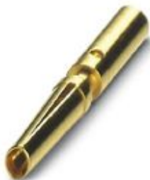
Crimp contact, turned, contact diameter: 0.8 mm, crimp range: 0.08 mm 2 ... 0.25 mm 2

Please be informed that the data shown in this PDF Document is generated from our Online Catalog. Please find the complete data in the user's documentation. Our General Terms of Use for Downloads are valid ( http://phoenixcontact.com/download )