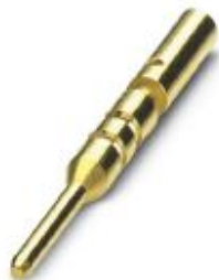
Crimp contact, turned, contact diameter: 0.8 mm, crimp range: 0.08 mm 2 ... 0.25 mm 2

Please be informed that the data shown in this PDF Document is generated from our Online Catalog. Please find the complete data in the user's documentation. Our General Terms of Use for Downloads are valid ( http://phoenixcontact.com/download )