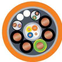
Cable cross section