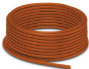
Hybrid cable, length: 20 m, color of outer sheath: orange RAL 2003

Please be informed that the data shown in this PDF Document is generated from our Online Catalog. Please find the complete data in the user's documentation. Our General Terms of Use for Downloads are valid ( http://phoenixcontact.com/download )