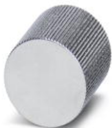
Metal protection cap for M23 hybrid connectors with external thread

Please be informed that the data shown in this PDF Document is generated from our Online Catalog. Please find the complete data in the user's documentation. Our General Terms of Use for Downloads are valid ( http://phoenixcontact.com/download )