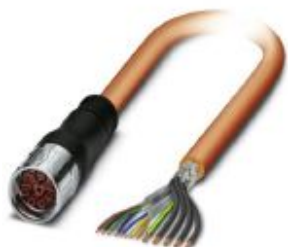
Cable plug in molded plastic, length: 5 m, color of outer sheath: orange RAL 2003

Please be informed that the data shown in this PDF Document is generated from our Online Catalog. Please find the complete data in the user's documentation. Our General Terms of Use for Downloads are valid ( http://phoenixcontact.com/download )