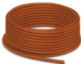
Hybrid cable, length: 100 m, color of outer sheath: orange RAL 2003

Please be informed that the data shown in this PDF Document is generated from our Online Catalog. Please find the complete data in the user's documentation. Our General Terms of Use for Downloads are valid ( http://phoenixcontact.com/download )