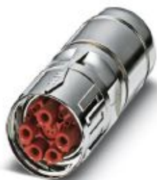
Cable connector, SB, straight long, shielded: yes, SPEEDCON locking, M40, No. of pos.: 8+4+PE, type of contact: Socket, Crimp connection, cable diameter range: 9 mm ... 14 mm

Please be informed that the data shown in this PDF Document is generated from our Online Catalog. Please find the complete data in the user's documentation. Our General Terms of Use for Downloads are valid ( http://phoenixcontact.com/download )