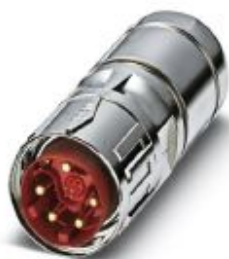
Cable connector, SB, straight long, shielded: yes, SPEEDCON locking, M40, No. of pos.: 8+4+PE, type of contact: Pin, Crimp connection, cable diameter range: 9 mm ... 14 mm

Please be informed that the data shown in this PDF Document is generated from our Online Catalog. Please find the complete data in the user's documentation. Our General Terms of Use for Downloads are valid ( http://phoenixcontact.com/download )