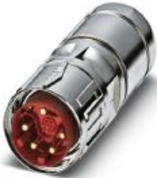
Cable connector, SB, straight long, shielded: yes, SPEEDCON locking, M40, No. of pos.: 8+4+PE, type of contact: Pin, Crimp connection, cable diameter range: 20.5 mm ... 26.5 mm

Please be informed that the data shown in this PDF Document is generated from our Online Catalog. Please find the complete data in the user's documentation. Our General Terms of Use for Downloads are valid ( http://phoenixcontact.com/download )