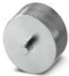
Metal protection cap for M40 connectors with external thread

Metal protective cap - SB-Z0001 - 1623827