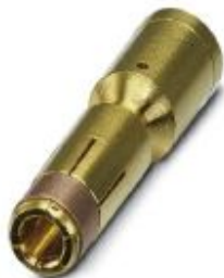
Crimp contact, turned, Single contact, contact diameter: 3.6 mm, crimp range: 16 mm 2 ... 16 mm 2

Please be informed that the data shown in this PDF Document is generated from our Online Catalog. Please find the complete data in the user's documentation. Our General Terms of Use for Downloads are valid ( http://phoenixcontact.com/download )