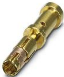
Crimp contact, turned, contact diameter: 1 mm, crimp range: 0.06 mm 2 ... 0.25 mm 2

Please be informed that the data shown in this PDF Document is generated from our Online Catalog. Please find the complete data in the user's documentation. Our General Terms of Use for Downloads are valid ( http://phoenixcontact.com/download )