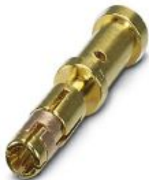
Crimp contact, turned, contact diameter: 1 mm, crimp range: 0.34 mm 2 ... 0.5 mm 2

Please be informed that the data shown in this PDF Document is generated from our Online Catalog. Please find the complete data in the user's documentation. Our General Terms of Use for Downloads are valid ( http://phoenixcontact.com/download )