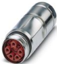
Coupling connector, SB, straight long, shielded: yes, for standard and SPEEDCON interlock, M40, No. of pos.: 8+4+PE, type of contact: Socket, Crimp connection, cable diameter range: 9 mm ... 14 mm

Please be informed that the data shown in this PDF Document is generated from our Online Catalog. Please find the complete data in the user's documentation. Our General Terms of Use for Downloads are valid ( http://phoenixcontact.com/download )