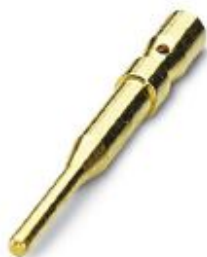
Crimp contact, turned, contact diameter: 1 mm, crimp range: 0.08 mm 2 ... 0.22 mm 2

Please be informed that the data shown in this PDF Document is generated from our Online Catalog. Please find the complete data in the user's documentation. Our General Terms of Use for Downloads are valid ( http://phoenixcontact.com/download )