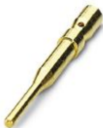
Crimp contact, turned, contact diameter: 1 mm, crimp range: 0.14 mm 2 ... 0.56 mm 2

Please be informed that the data shown in this PDF Document is generated from our Online Catalog. Please find the complete data in the user's documentation. Our General Terms of Use for Downloads are valid ( http://phoenixcontact.com/download )