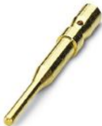
Crimp contact, turned, contact diameter: 1 mm, crimp range: 0.5 mm 2 ... 1 mm 2

Please be informed that the data shown in this PDF Document is generated from our Online Catalog. Please find the complete data in the user's documentation. Our General Terms of Use for Downloads are valid ( http://phoenixcontact.com/download )