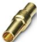
Crimp contact, turned, Single contact, contact diameter: 1 mm, crimp range: 0.08 mm 2 ... 0.22 mm 2