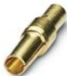
Crimp contact, turned, Single contact, contact diameter: 1 mm, crimp range: 0.14 mm 2 ... 0.56 mm 2