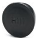
Plastic protection cap, antistatic, for connectors with M23 knurled nut

Plastic anti-static dust protection cap - RC-Z2468 - 1611796