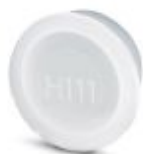
Plastic protection cap for connectors with M23 knurled nut

Plastic anti-static dust protection cap - RC-Z2468 - 1611796