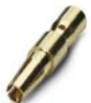
Crimp contact, turned, contact diameter: 1.5 mm, crimp range: 0.5 mm 2 ... 1 mm 2