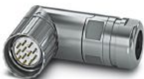
The figure shows the 12-pos. product version with solder contacts

Cable connector, CA, angled, shielded: yes, Screw locking, M23, No. of pos.: 16+2+PE, type of contact: Pin, Crimp connection, cable diameter range: 10 mm ... 14.5 mm