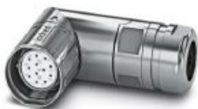
The figure shows the 12-pos. product version

Cable connector, CA, angled, shielded: yes, SPEEDCON locking, M23, No. of pos.: 16+2+PE, type of contact: Socket, Crimp connection, cable diameter range: 6 mm ... 10 mm