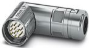
The figure shows the 12-pos. product version with solder contacts

Cable connector, CA, angled, shielded: yes, SPEEDCON locking, M23, No. of pos.: 16+2+PE, type of contact: Pin, Crimp connection, cable diameter range: 3 mm ... 14.5 mm