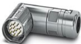
The figure shows the 12-pos. product version with solder contacts

Cable connector, CA, angled, shielded: yes, SPEEDCON locking, M23, No. of pos.: 16+2+PE, type of contact: Pin, Crimp connection, cable diameter range: 10 mm ... 14.5 mm