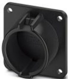
Retainer for Vehicle Connector as parking position at charging stations (EVSE), Type 1, SAE J1772, Front mounting

Please be informed that the data shown in this PDF Document is generated from our Online Catalog. Please find the complete data in the user's documentation. Our General Terms of Use for Downloads are valid ( http://phoenixcontact.com/download )