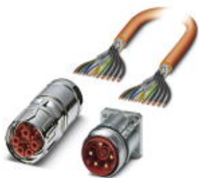
M40 Hybrid sample set, SB series, consisting of cable connector, straight device connector, and sample cable

Please be informed that the data shown in this PDF Document is generated from our Online Catalog. Please find the complete data in the user's documentation. Our General Terms of Use for Downloads are valid ( http://phoenixcontact.com/download )