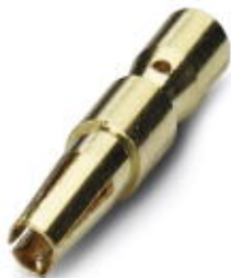
Crimp contact, turned, contact diameter: 1.5 mm, crimp range: 0.08 mm 2 ... 0.22 mm 2

Please be informed that the data shown in this PDF Document is generated from our Online Catalog. Please find the complete data in the user's documentation. Our General Terms of Use for Downloads are valid ( http://phoenixcontact.com/download )