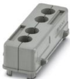
Divisible cable feed-through for HC-B24-... panel mounting base; for four lines

Please be informed that the data shown in this PDF Document is generated from our Online Catalog. Please find the complete data in the user's documentation. Our General Terms of Use for Downloads are valid ( http://phoenixcontact.com/download )