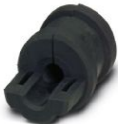
Cable feed-through sleeves, for cable diameters of 3 - 4 mm, a cable binder can be used as strain relief

Please be informed that the data shown in this PDF Document is generated from our Online Catalog. Please find the complete data in the user's documentation. Our General Terms of Use for Downloads are valid ( http://phoenixcontact.com/download )