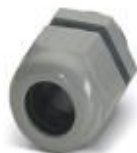
Cable gland, cable gland material: PA, external cable diameter 11 mm ... 17 mm, shielding: no, connecting thread: M25 x 1.5, color: silver-gray RAL 7001

Cable gland - G-INS-M25-M68N-PNES-GY - 1411126