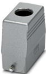
HEAVYCON sleeve housing B16, for single locking latch, height 76 mm, without support 1x M25, straight conductor exit

Please be informed that the data shown in this PDF Document is generated from our Online Catalog. Please find the complete data in the user's documentation. Our General Terms of Use for Downloads are valid ( http://phoenixcontact.com/download )