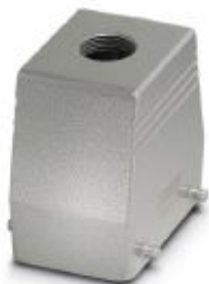
HEAVYCON sleeve housing D50, for double locking latch, height 76 mm, without support 1x M32, straight conductor exit

Please be informed that the data shown in this PDF Document is generated from our Online Catalog. Please find the complete data in the user's documentation. Our General Terms of Use for Downloads are valid ( http://phoenixcontact.com/download )