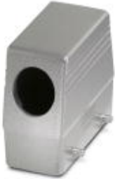
HEAVYCON B16 sleeve housing, for double locking latch, height: 76 mm, with 1 x M32 thread, lateral cable outlet

Please be informed that the data shown in this PDF Document is generated from our Online Catalog. Please find the complete data in the user's documentation. Our General Terms of Use for Downloads are valid ( http://phoenixcontact.com/download )